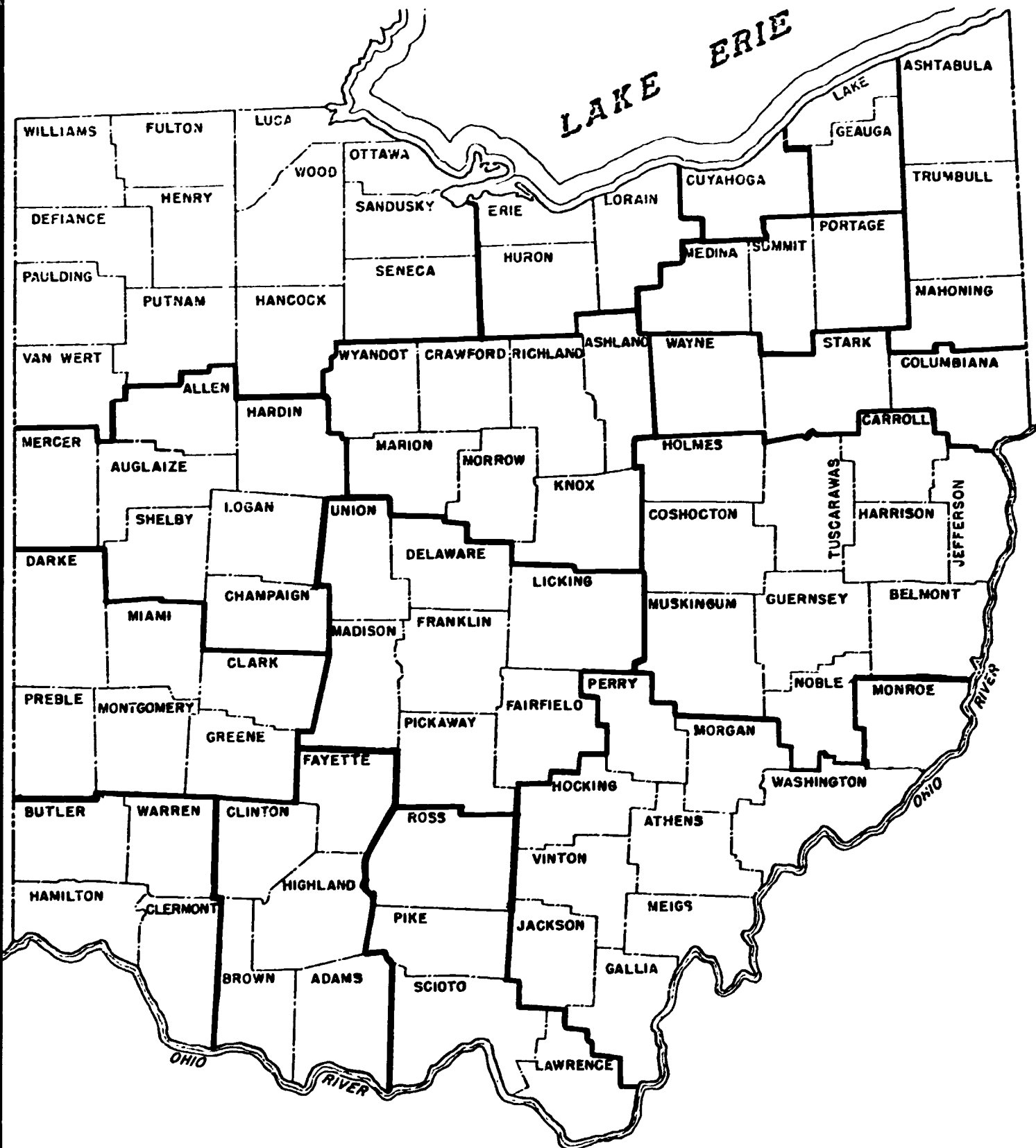
MAP OF OHIO SERRC NETWORK REGIONS